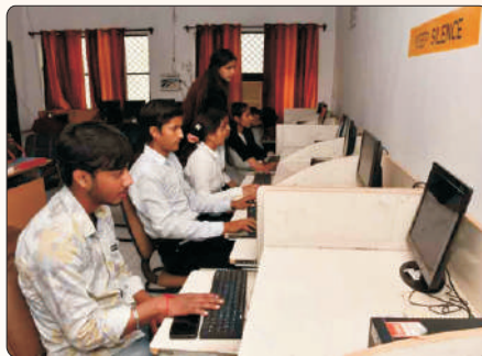
Computer Lab - II