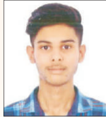
Manthan, 2nd 10+1 (Non-Medical) 475/500 (95%)