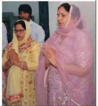
Inauguration of new session with blessing of Shri Sukhmani Sahib Path at college