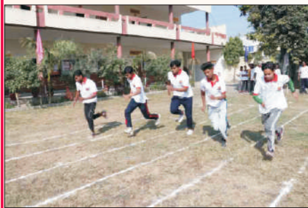
Boys participating in 200m Race in Athletic Meet