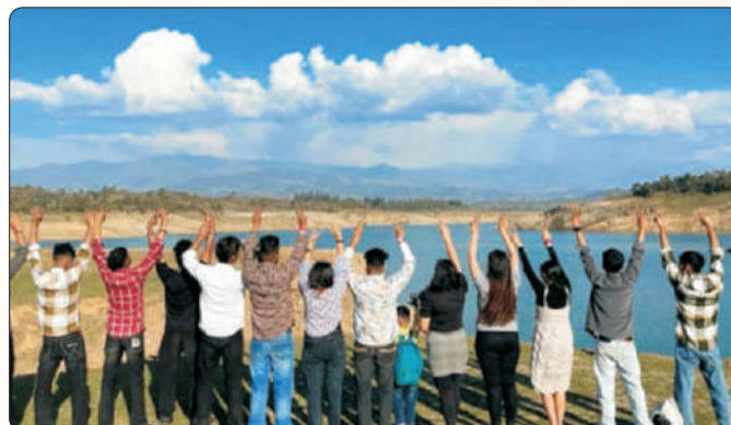
An Educational Trip to Mini Goa