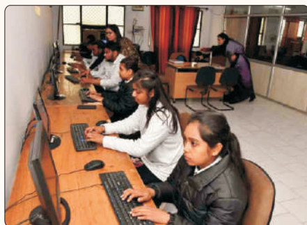
Computer Lab - I