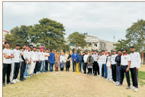
Intra College Cricket Tournament