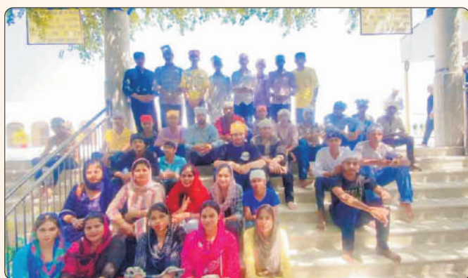
An Educational trip to Sultanpur Lodhi Kapurthala