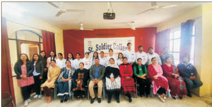
College cabinet 2023-24