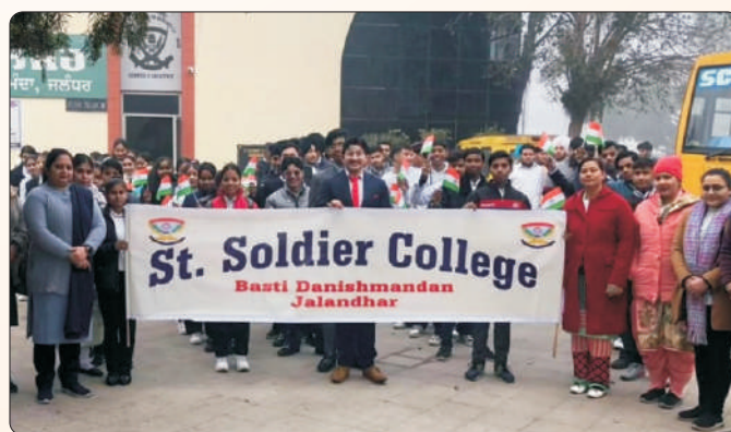
Republic Day Celebration in the college campus by Staff and students