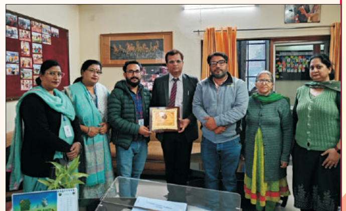
World aids day celebration