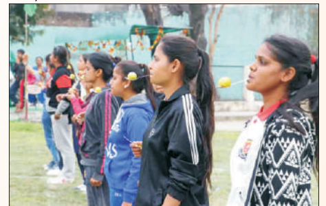
Girls participating in Spoon Lemon Race