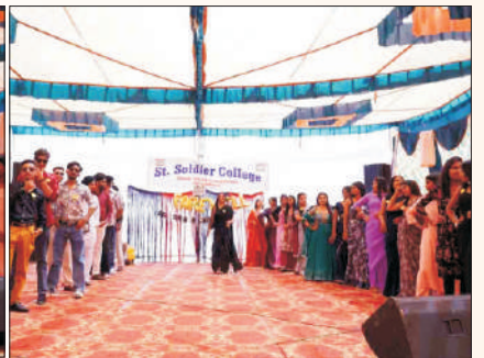
Students of college on Farewell (2023-24)