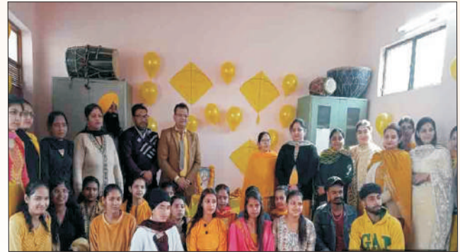
Basant celebration at college with the students and staff