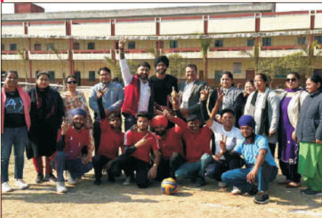
Intra College Volleyball Championship, Winner Team with Principal and Staff Members