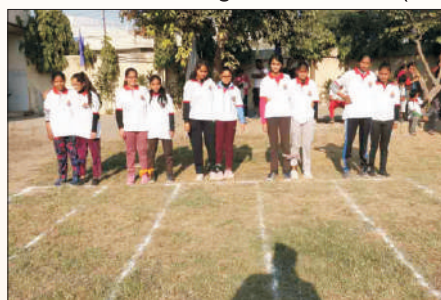
Girls Participating in Three leg race