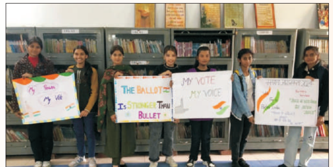
Vote Awareness Campaign organised at College