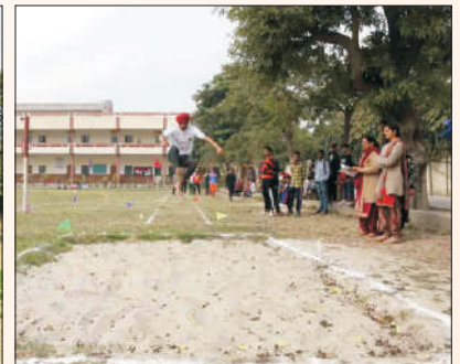
Students participating in Long Jump